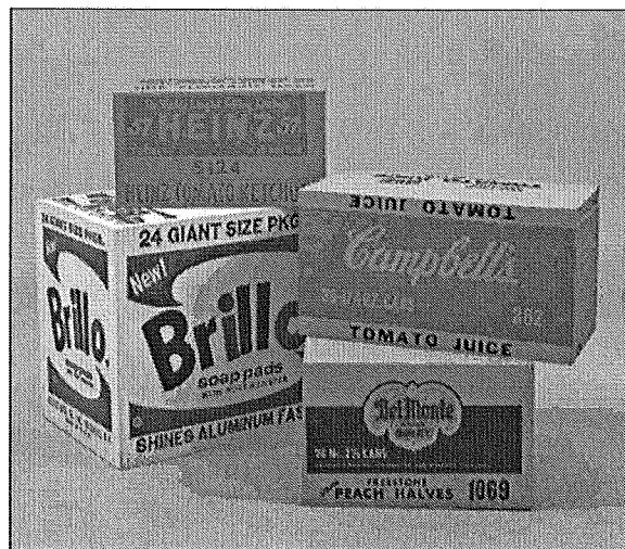
Figure 1 – Box Sculptures

they had sought, the director of the National Gallery of Canada, Charles Comfort, a painter, had this to say.