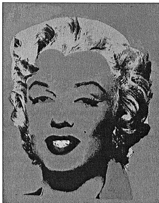
Figure 3 – Orange Marilyn